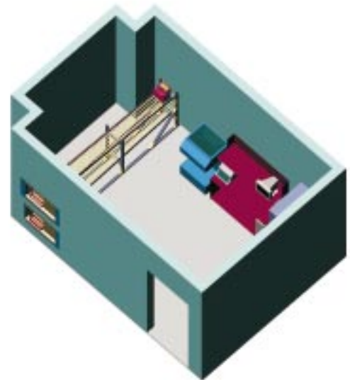
Overhead View of Money Room Management System